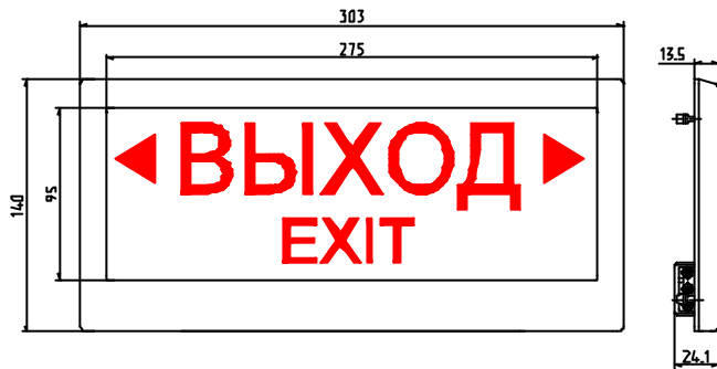
Exit sign ES-3 P/N 335101.003